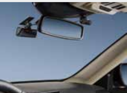
Dash cam systems 1

New Vehicle Limited Warranty. We want your Ford EcoSport ownership experience to be the best it can be. Under this warranty, your new vehicle comes with 3-year/36,000-mile bumper-to-bumper coverage, 5-year/60,000-mile Powertrain Warranty coverage, 5-year/60,000-mile safety restraint coverage, and 5-year/unlimited-mile corrosion perforation (aluminum panels do not require perforation) coverage – all with no deductible. Please ask your Ford Dealer for a copy of this limited warranty.