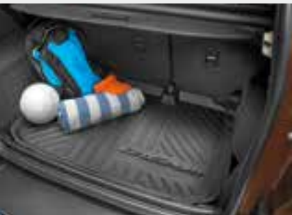
Cargo area protector