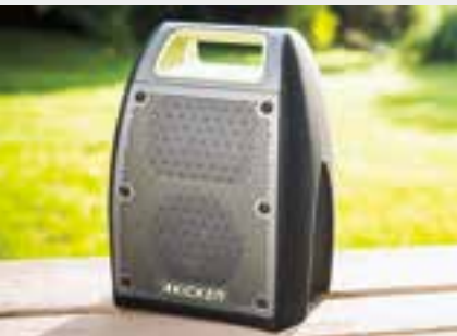
Portable Bluetooth® speaker