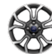
17" PAINTED MACHINED ALUMINUM Standard