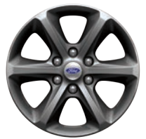
18" MAGNETIC-PAINTED CAST-ALUMINUM

Always consult the owner's manual before off-road driving. Follow all laws and drive on designated off-road trails and recreation areas.