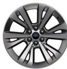
22" 6-SPOKE PAINTED MACHINED-FACE ALUMINUM WITH DARK TARNISH-PAINTED POCKETS Included with 302A