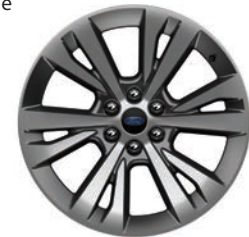
22" 6-SPOKE PAINTED MACHINED-FACE ALUMINUM WITH DARK TARNISH- PAINTED POCKETS Standard

Heavy-Duty Trailer Tow Package: heavy-duty radiator, Pro Trailer Backup Assist™ 3.73 electronic limited-slip rear differential (eLSD), integrated trailer brake controller, and 2-speed automatic 4WD (4x4 only) with Neutral towing capability 2nd-row power-folding tip-and-slide captain's chairs 4-wheel drive (4WD) (includes 1-speed transfer case, Terrain Management System™, Hill Descent Control and front tow hooks) Dual-Headrest Rear Seat Entertainment System 4 Engine block heater Floor liners for 1st and 2nd rows Reversible