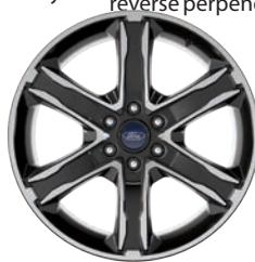
22" PREMIUM BLACK-PAINTED ALUMINUM Included with Stealth Edition (303A), Special Edition and Texas Edition Packages