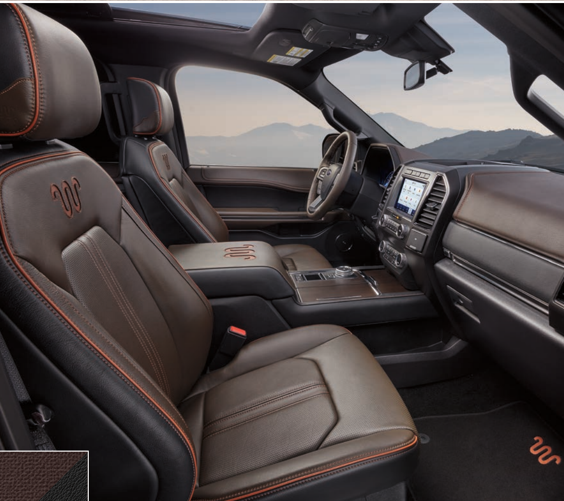
DEL RIO LEATHER-TRIMMED SEATING SURFACES: Mesa/Ebony

Available equipment shown. 1 Additional charge. 2 Metallic. 3 Ford Licensed Accessory.