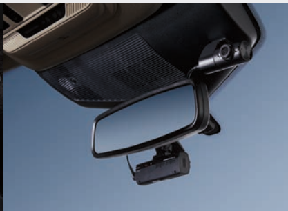
Dash cam systems 1

SHOP THE COMPLETE COLLECTION | accessories.ford.com