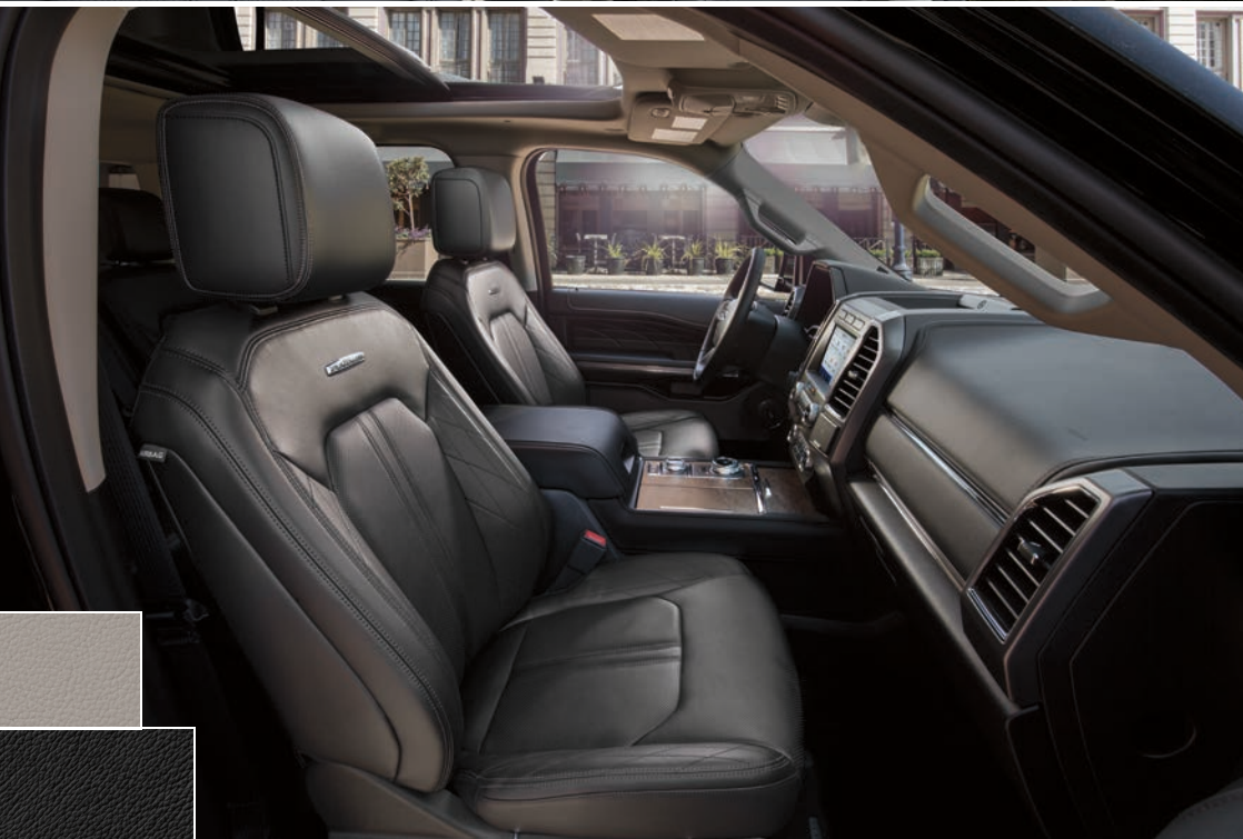
LEATHER-TRIMMED SEATING SURFACES: Medium Soft Ceramic, Ebony

ENHANCED 3.5L ECOBOOST V6 WITH AUTO START-STOP TECHNOLOGY 10-SPEED AUTOMATIC TRANSMISSION