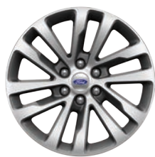
20" PREMIUM DARK TARNISH-PAINTED ALUMINUM Standard

Voice-Activated Touchscreen Navigation System with pinch-to-zoom capability (includes SiriusXM Traffic