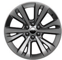
22" 6-SPOKE PAINTED MACHINED-FACE ALUMINUM WITH DARK TARNISH- PAINTED POCKETS AND KING RANCH CENTER CAP

Cargo Package: advanced cargo manager, and roof-rail crossbars Heavy-Duty Trailer Tow Package: heavy-duty radiator, Pro Trailer Backup Assist,™ 3.73 electronic limited-slip rear differential (eLSD), integrated trailer brake controller, and 2-speed automatic 4WD (4x4 only) with Neutral towing capability 4-wheel drive (4WD) (includes 1-speed transfer case, Terrain Management System,™ Hill Descent Control and front tow hooks) Dual-Headrest Rear Seat Entertainment System 3 Engine block heater Floor liners for 1st and 2nd rows Inflatable 2nd-row safety belts in outboard seating