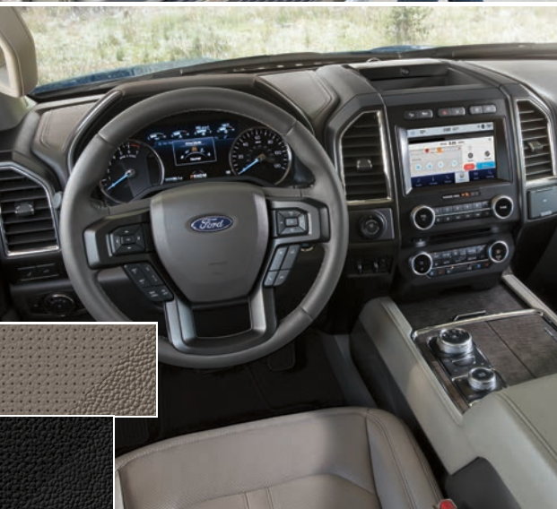
LEATHER-TRIMMED SEATING SURFACES: Medium Stone, Ebony