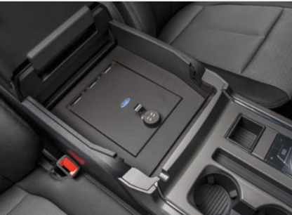
In-vehicle safe 1

Expedition MAX Platinum in Rapid Red Metallic Tinted Clearcoat accessorized with hood deflector, side window deflectors, 1 splash guards, 1 roof crossbars, and