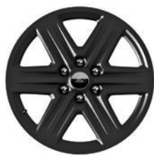
20" 6-SPOKE GLOSS BLACK-PAINTED ALUMINUM Optional 3 Not available with 302A, or Stealth Edition (303A), FX4 Off-Road, Special Edition or Texas Edition Packages