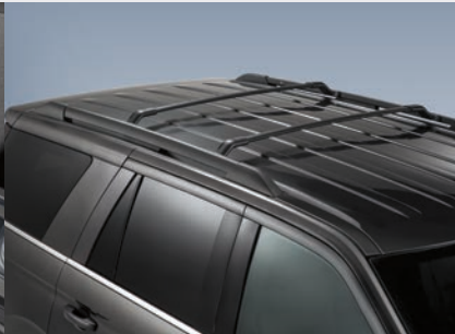
Roof crossbars 2